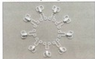
• Hook and Eye for garments