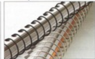
• Metal spiral