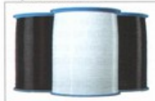
• Nylon coated wires